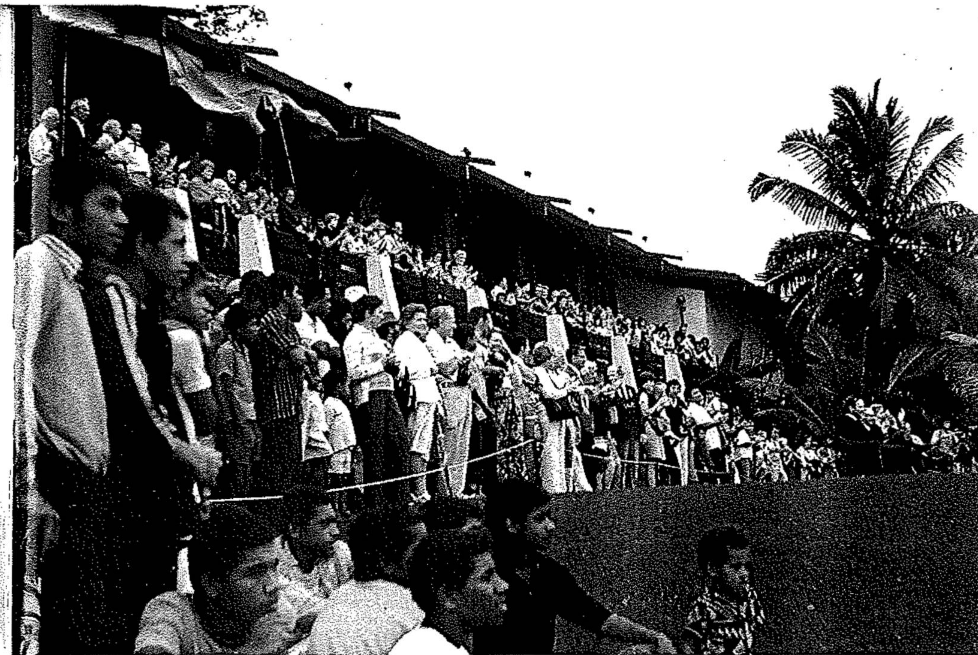
Sizeable galleries attended both the men's and women's championships.